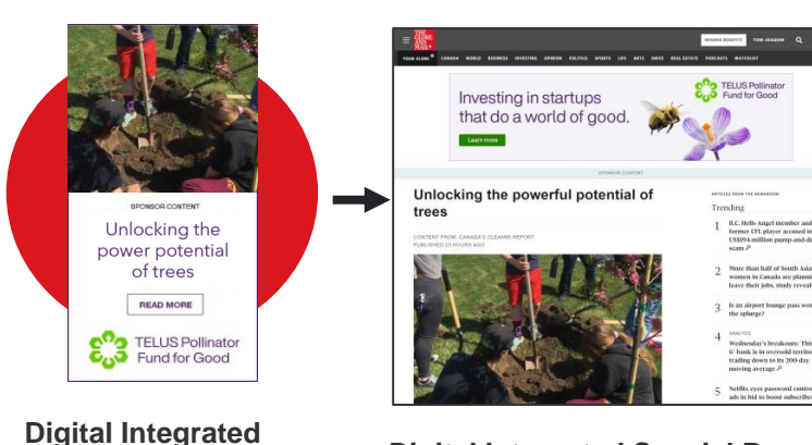
Special Report Content Discovery -Standard Digital Traffic Driver.

Your brand mentioned within the integrated report among participating advertisers