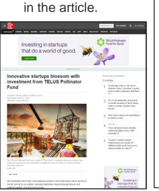
Digital Sponsor Content Custom developed with the client