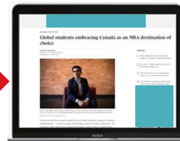
ARTICLES RUN IN PARTNERS SECTION WITH ADJACENT SPONSOR BRAND ADS